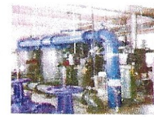
Water Treatment Facility

The NYS Department of Health completed a source water assessment of our water. This assessment found a moderate susceptibility to contamination for this source of drinking water. The amount of agricultural lands in the assessment area results in elevated potential for protozoa, phosphorus, DBP (disinfection byproduct) precursors, and pesticide contamination. There is also a moderate density of sanitary wastewater discharges, but the ratings for the individual discharges do not result in elevated susceptibility ratings. However, it appears that the total amount of wastewater discharged to surface water in this assessment area is high enough to further raise the potential for contamination (particularly for protozoa). There are no noteworthy contamination threats associated with other discrete contaminant sources.